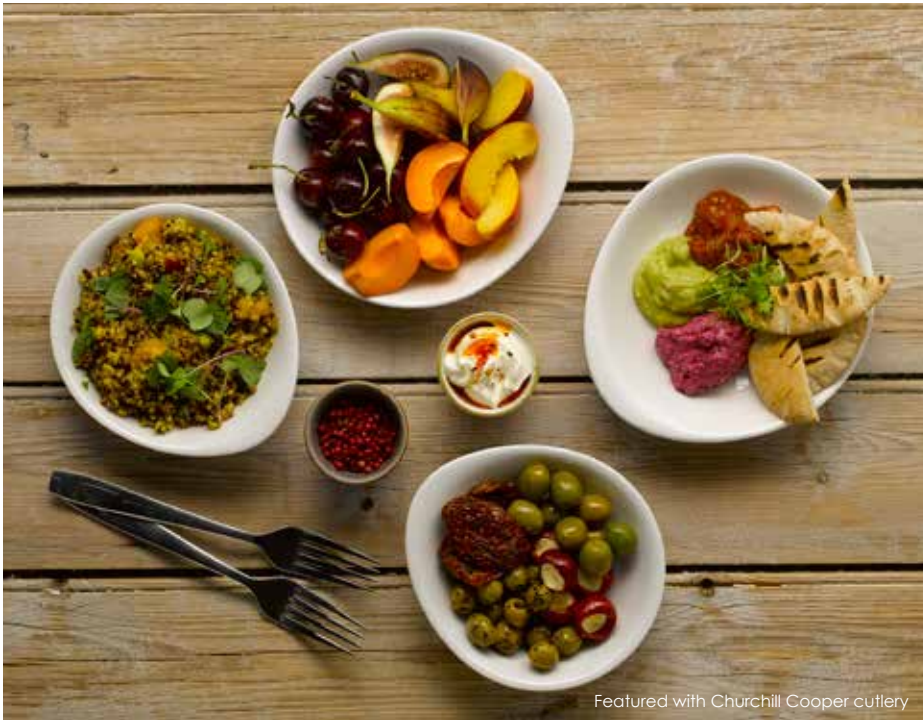
Featured with Churchill Cooper cutlery

Innovative shapes and reactive glazes enhance the presentation of side dishes, bowl foods and sharing plates. The versatile shapes are designed to work alongside a variety of other Churchill tableware and wood items.