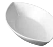
LARGE ECLIPSE DISH WHVYLED 1 21cm 8¼" 4lcl 15oz CTN QTY 6