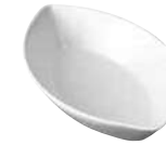
ECLIPSE DISH WHVYED 1 18.5cm 7½" 22.4cl 8oz CTN QTY 12